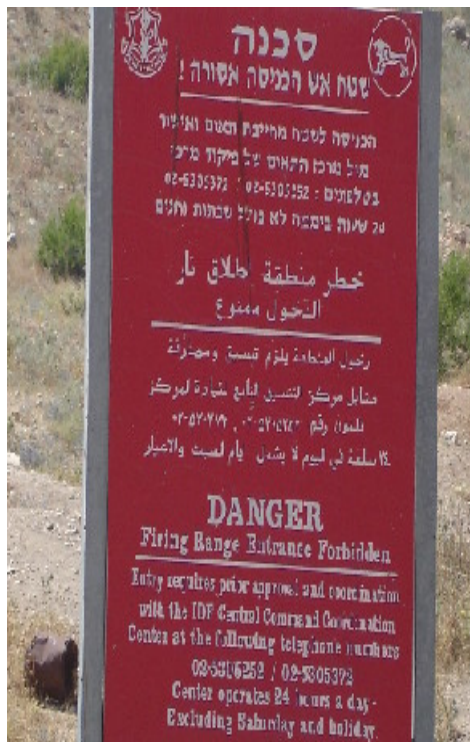
Sign posted at Israeli firing range in the northern Jordan Valley (May 2006)

Though the policy of prohibiting Palestinian access to closed military zones remains unchanged, prior to 1990, Israeli army practices that targeted livestock owners differed. According to Palestinian residents, previously employed measures included: using air patrols to pursue shepherds near military zones; verbally informing Palestinians that they were prohibited from owning animals and threatening those who failed to comply with the risk of being evacuated from their villages; confiscating or killing animals; physically assaulting sheep herders; imprisoning privately-owned sheep; and holding court trials between 1968 and 1987 to impose fines on Palestinian animal owners (e.g. 25 JDs per cow).