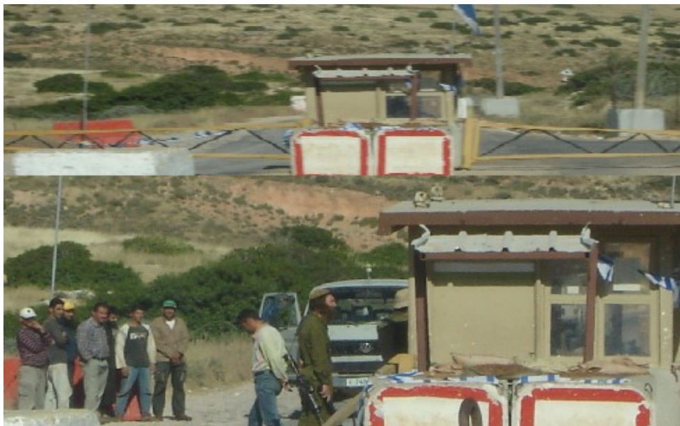
Tayasir Checkpoint between Tubas and Jenin & the northern Jordan Valley (May 2006)

According to the Palestinian District Liaison Office in Jericho, between 1 January and 28 March 2006, there were 1,066 permit applications submitted by Jordan Valley residents for crossing internal checkpoints. 40 Of these, approximately 74 per cent (788) were accepted and 10 per cent (106) were under inspection. By comparison, there were only 37 permit applications for accessing Occupied East Jerusalem and areas within Israel for personal needs (e.g. medical or family reasons), almost all of which (36) were rejected. 41 Although approval rates of permit applications for crossing into the Jordan Valley area are higher than those for accessing Occupied East Jerusalem as well as Israel, Israel’s unilaterally-created permit requirement still denies Palestinians their basic right to visit relatives, work, cultivate their land, and travel in the Occupied Jordan Valley without obtaining permission from the Israeli military.